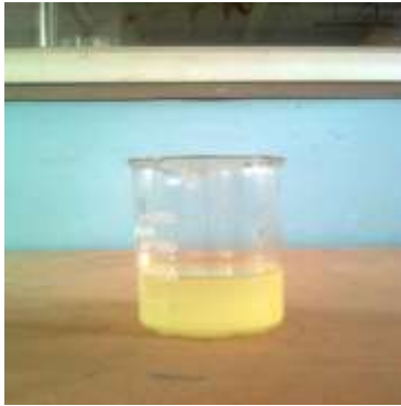
Figure 1: emulsion 1