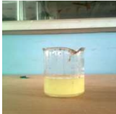
Figure 2 : emulsion 2 Figure 1: emulsion 1