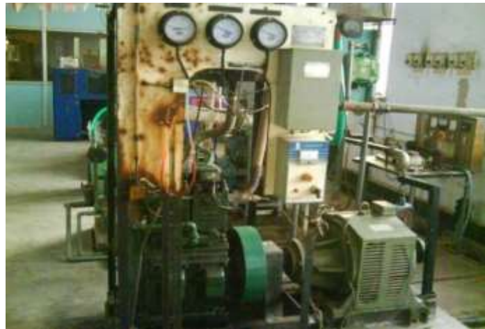
Figure 4: Engine Set Up

Comet diesel engine, twin cylinder, vertical water cooled, 7.5 KW @ 1500rpm. Compression ratio = 17.5, Eddy current dynamometer, Fuel measuring device, Stop watch scale and, Spring balance