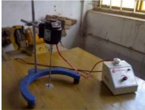
Figure 5: Mechanical Agitator

This is used to thoroughly mix the mixture and form the emulsion. It consists of a motor which is used to rotate the blades which is dipped in the mixture. There is speed control knob to optimize the speed of the motor.