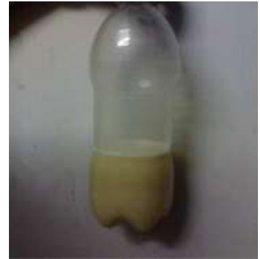
Figure 3 : emulsion 3